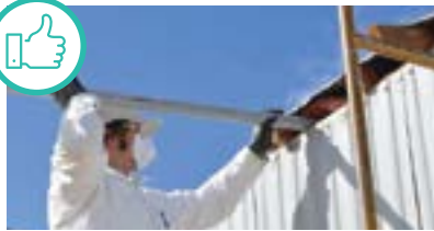
Insulated manufactured home roof through edge.