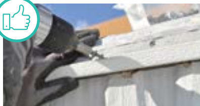
Edge of roof secured and gutter re-attached.