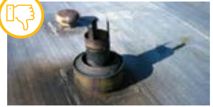
Penetrations should be sealed from the outside.