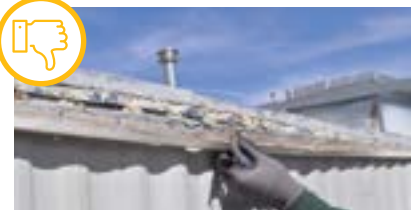
Gutter not properly attached, potential leaks at roof edge.