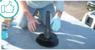
Roof penetration properly sealed.