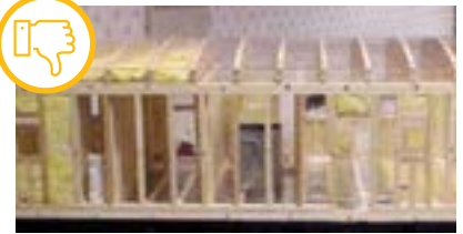
Uninsulated manufactured home roof.