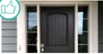
New ENERGY STAR door.