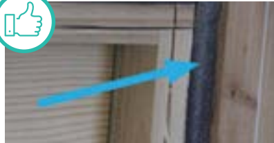
Closed-cell foam seals the gap.