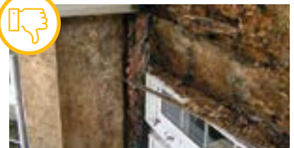
Improperly flashed door has structural damage due to water penetration.