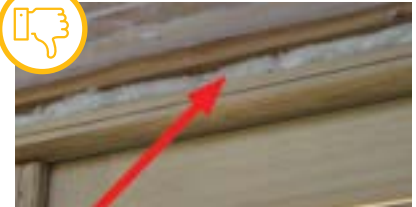
Loose-fill insulation allows moisture and air infiltration.