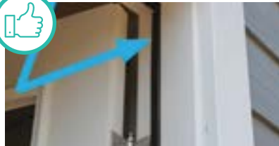
Good weatherstripping.