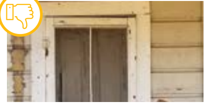
Inefficient door needs to be replaced.